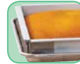
Make sheet cakes without cake pan