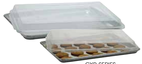
CXP-SERIES (sheet pan not included)