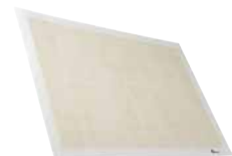
SBS-16, -21, -24