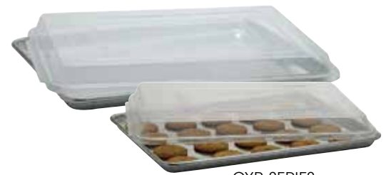
CXP-SERIES (sheet pan not included)