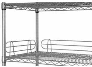
Chromate and Black Epoxy Style