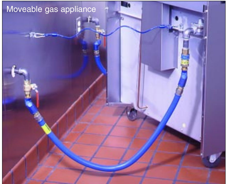
Moveable gas appliance

The Dormont Supr-Swivel multi-plane fitting is a patented, innovative device that increases the functionality and service life of the Dormont Supr-Safe® gas appliance connector by increasing its range of motion. The Supr-Swivel enables easier movement of the caster-mounted appliances at angles, back-and-forth, and from side-to-side, while relieving stress at the ends of the hose to prevent crimping or premature failure of the connector. In addition, it provides more aisle space in a commercial kitchen by allowing the appliances to be positioned closer to the wall. No other swivel fitting can match the patented functionality of the Dormont Supr-Swivel multi-plane fitting.