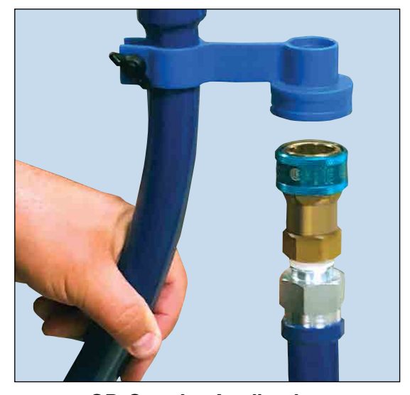
QD Coupler Application