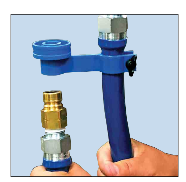
QD Nipple Application