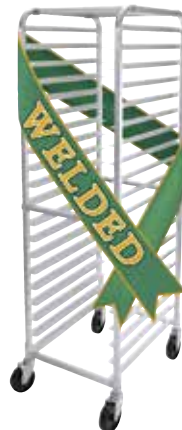
AWRK-20 *10 Tier Available