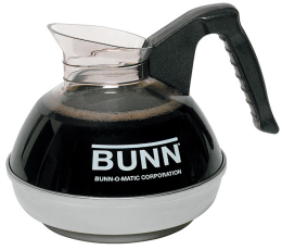
EASY POUR,(BLK) 6/CS