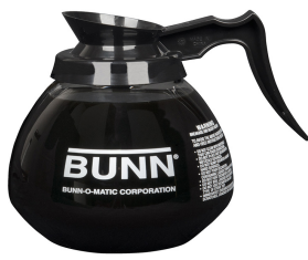
DECANTER, GLASS-BLK 12C 3/CS