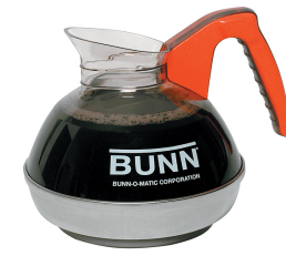
EASY POUR,(ORN) 3/CS