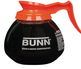
DECANTER, GLASS-ORN 12C 3/CS