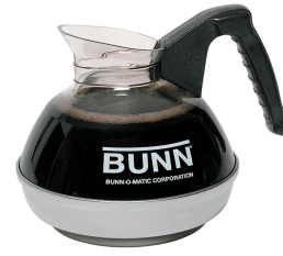
EASY POUR,(BLK) 3/CS