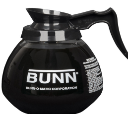
DECANTER,GLASS-BLK 12C 24/CS