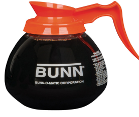
DECANTER, GLASS-ORN 12C 24/CS