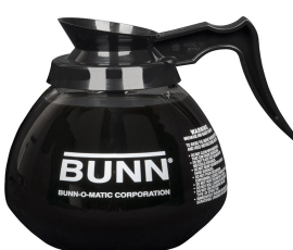
DECANTER,GLASS-BLK 12CUP 1PK