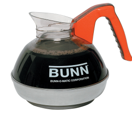
EASY POUR,(ORN) 6/CS