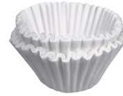
FILTERS, REGULAR 1M 500/2 50/CL