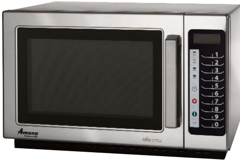
Model RCS10TS shown