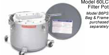
Model 60LC Filter Pot

For filtering and safer handling of hot oil Low profile to fit under drain valves