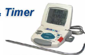
MTT Digital Frying Thermometer & Timer