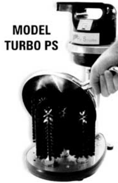
MODEL TURBO PS