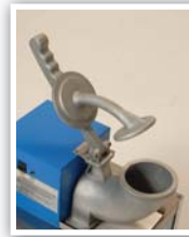
Cast Aluminum Assembly