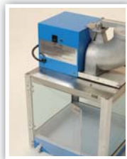
Polycarbonate Service Door