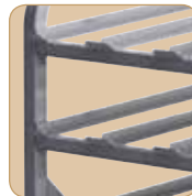
Tiers slant forward and raised edges prevent cans from rolling out