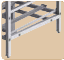
Reinforced frame, stainless steel levelers