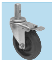
ALRC-5STK 5" caster with brake