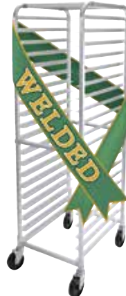
AWRK-20 *10 Tier Available