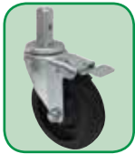
ALRC-5STK 5" caster with brake

See page 158 for more caster information, new item numbers