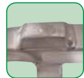
Bolt caps are welded over completely to form extra strength juncture