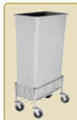
Fits most standard slim trash cans