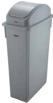
PTC-23SG & PTCL-23