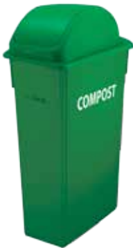
PTC-23GRC & PTCL-23GR