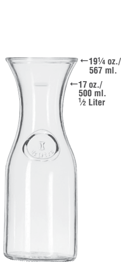
Carafe No. 97001 19 1 / 4 oz./56.7 cl./567 ml. H8 3 / 8 T3 B3 3 / 8 D3 1 / 8 1 doz./13# • .72 cu. ft. SCC 604753