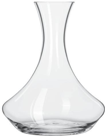
Vina Decanter No. 96958S1A ◊ 65 oz./1.9 L. H10 1 / 4 T3 1 / 8 B5 1 / 4 D7 3 / 8 2 pcs./7# • 1.01 cu. ft. SCC 293432