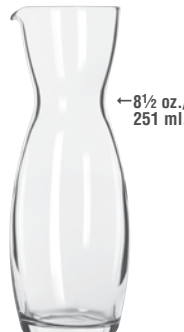
NEW Carafe No. 739 ● 10 3 / 4 oz./31.8 cl./318 ml. H7 T2 1 / 4 B2 D2 2 / 8 1 doz./7# • .42 cu. ft. SCC 490124