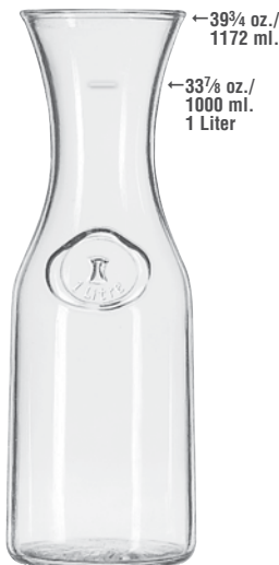
Carafe No. 97000 39 3 / 4 oz./117.2 cl./1172 ml. H10 7 / 8 T3 1 / 2 B3 3 / 4 D3 3 / 4 1 doz./21# • 1.35 cu. ft. SCC 598069