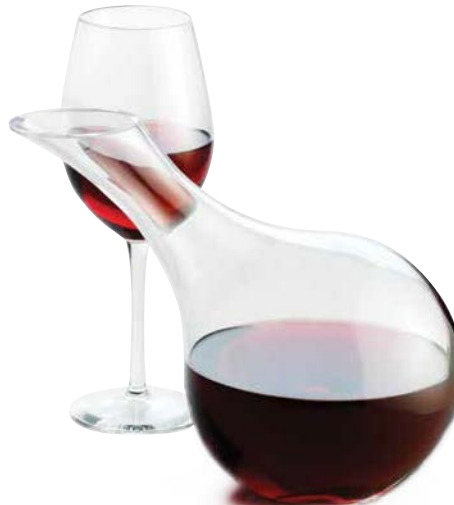
Vina Tilt Decanter No. 96763 ◊ 63 oz./1.9 L. H8 3 / 8 T2 3 / 4 B3 1 / 2 D6 6 pcs./12# • 1.77 cu. ft. SCC 478276