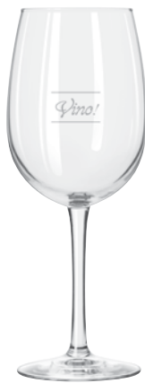
Wine w/Vino deco No. 7533-1358M ▲● 16 oz./47.4 cl./474 ml. H8 3 / 8 T2 2 / 8 B3 D3 1 / 2 1 doz./7# • .89 cu. ft. SCC 428264