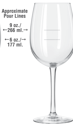
Vina Wine No. 7533-1178N ▲● 16 oz./47.4 cl./474 ml. H8 3 / 8 T2 2 / 8 B3 D3 1 / 2 1 doz./7# • .89 cu. ft. SCC 482969