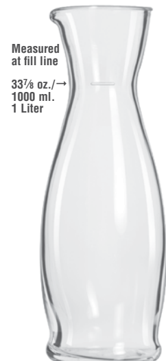
Carafe No. 13173021 H11 T3 1 / 4 B3 1 / 2 D3 3 / 8 1 doz./22# • 1.34 cu. ft. SCC 08002713091056