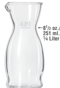
Carafe No. 13172621 H6 T2 3 / 4 B2 2 / 8 D2 2 / 8 1 doz./10# • .40 cu. ft. SCC 08002713097997