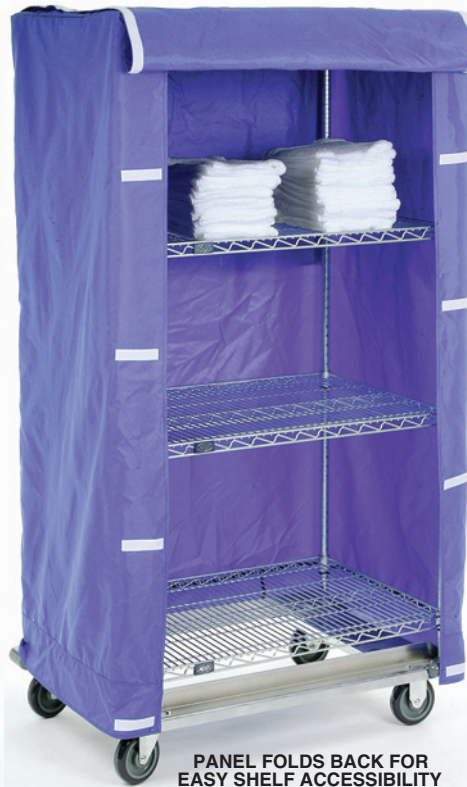
PANEL FOLDS BACK FOR EASY SHELF ACCESSIBILITY