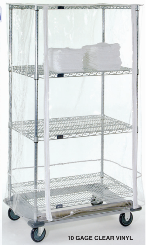
10 GAGE CLEAR VINYL

Helps keep contents dust and dirt free. Made of water resistant, 400 denier nylon or 10 gage vinyl with reinforced corners and double stitching for maximum durability. Velcro or zipper closure. Specify color suffix (RD) Red, (BL) Blue, (WH) White or (CL) Clear, when ordering. Special orders upon request.