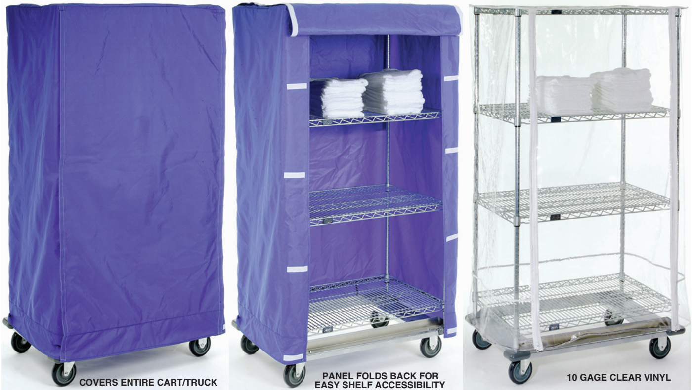
COVERS ENTIRE CART/TRUCK