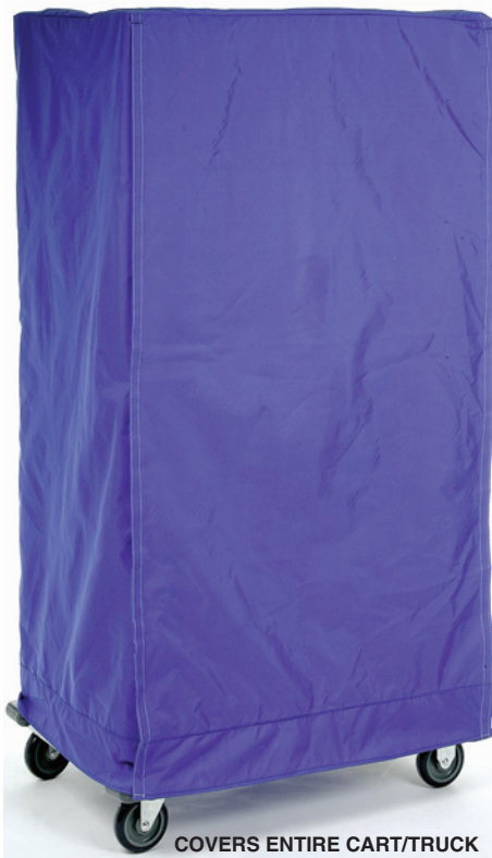
COVERS ENTIRE CART/TRUCK