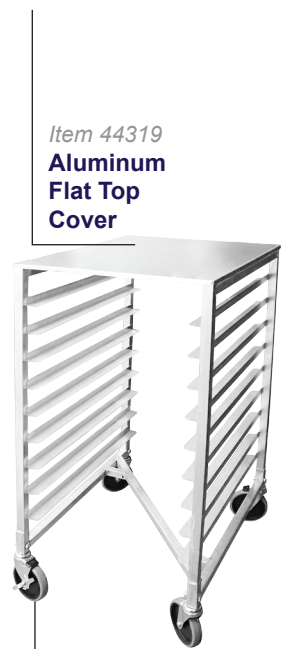
Item 44319 Aluminum Flat Top Cover