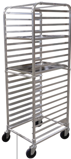
Item 28351 Aluminum Pan Rack 20 Slides Curve Top Welded