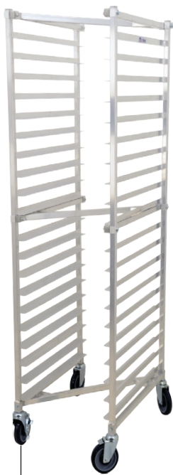
Item 43474 Aluminum Nesting Sheet Pan Rack 20 Slides Square Top Knock Down