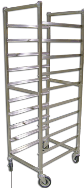
Item 23833 Stainless Steel Pan Rack 10 Slides Square Top Knock Down