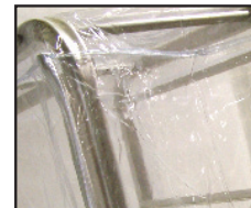
Nylon Rack Cover