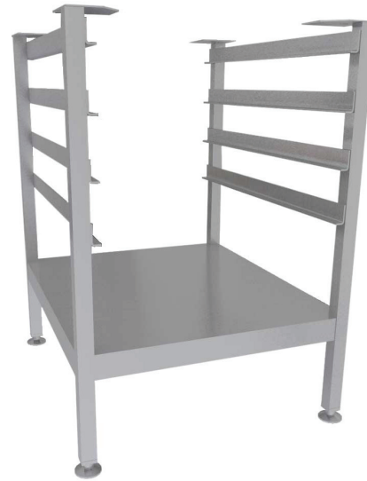
MODEL RL-34 SHOWN

Models: RL-18 RL-23 RL-28 RL-28G RL-28X RL-28XN RL-34 R18SS-3 R18SS-4 R18SS-5 S-EPXSS-1 S-EPXSS-2