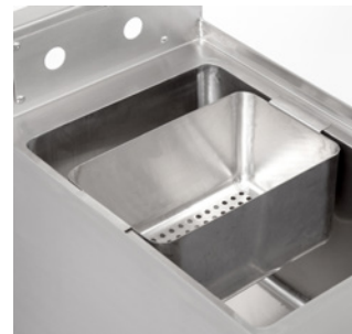
PERFORATED DUMP BASKET (INCLUDED)