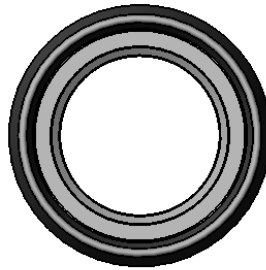
Black Tapered Rubber Bumper