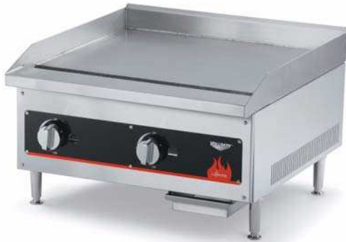
Cayenne® Gas Griddle - Model 40720