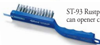
ST-93 Rustproof can opener cleaning tool