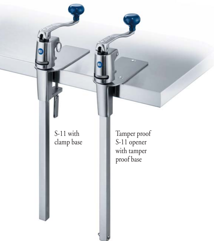
S-11 with clamp base