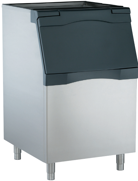
B530S shown with optional KLP8S legs